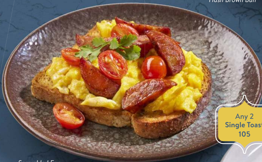
Scrambled Egg & Chorizo on Toast