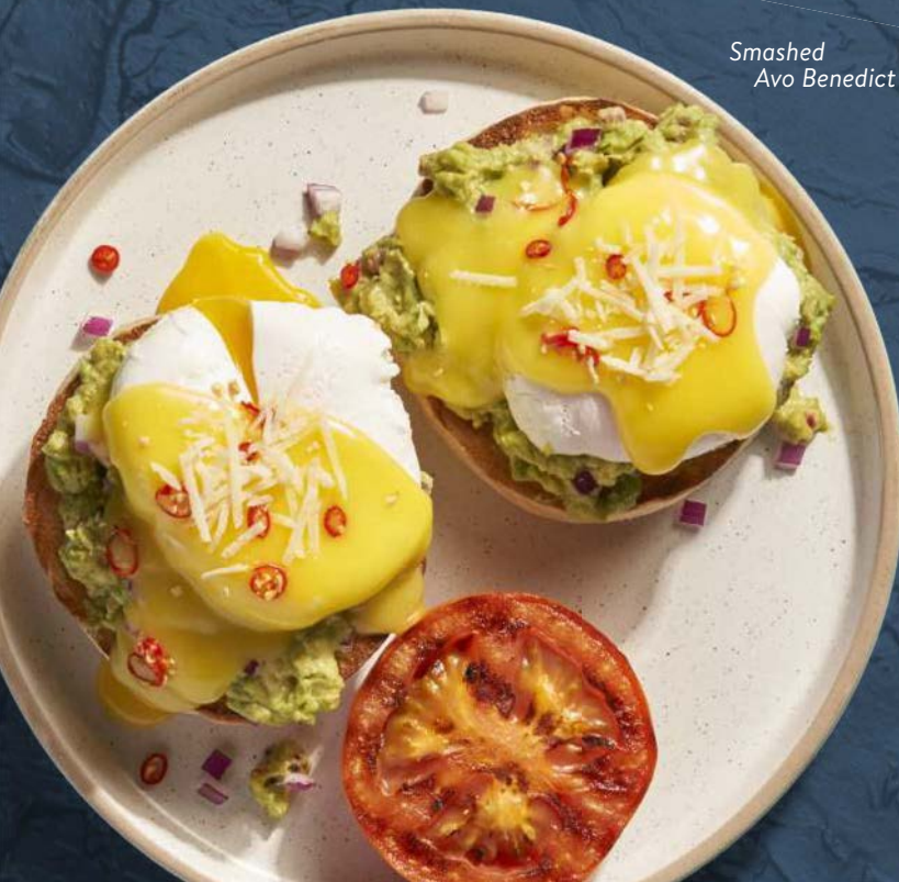
Smashed Avo Benedict