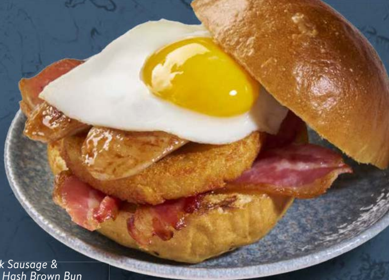
Pork Sausage & Hash Brown Bun

BBQ basted beef patty, cheddar cheese, streaky bacon & fried egg